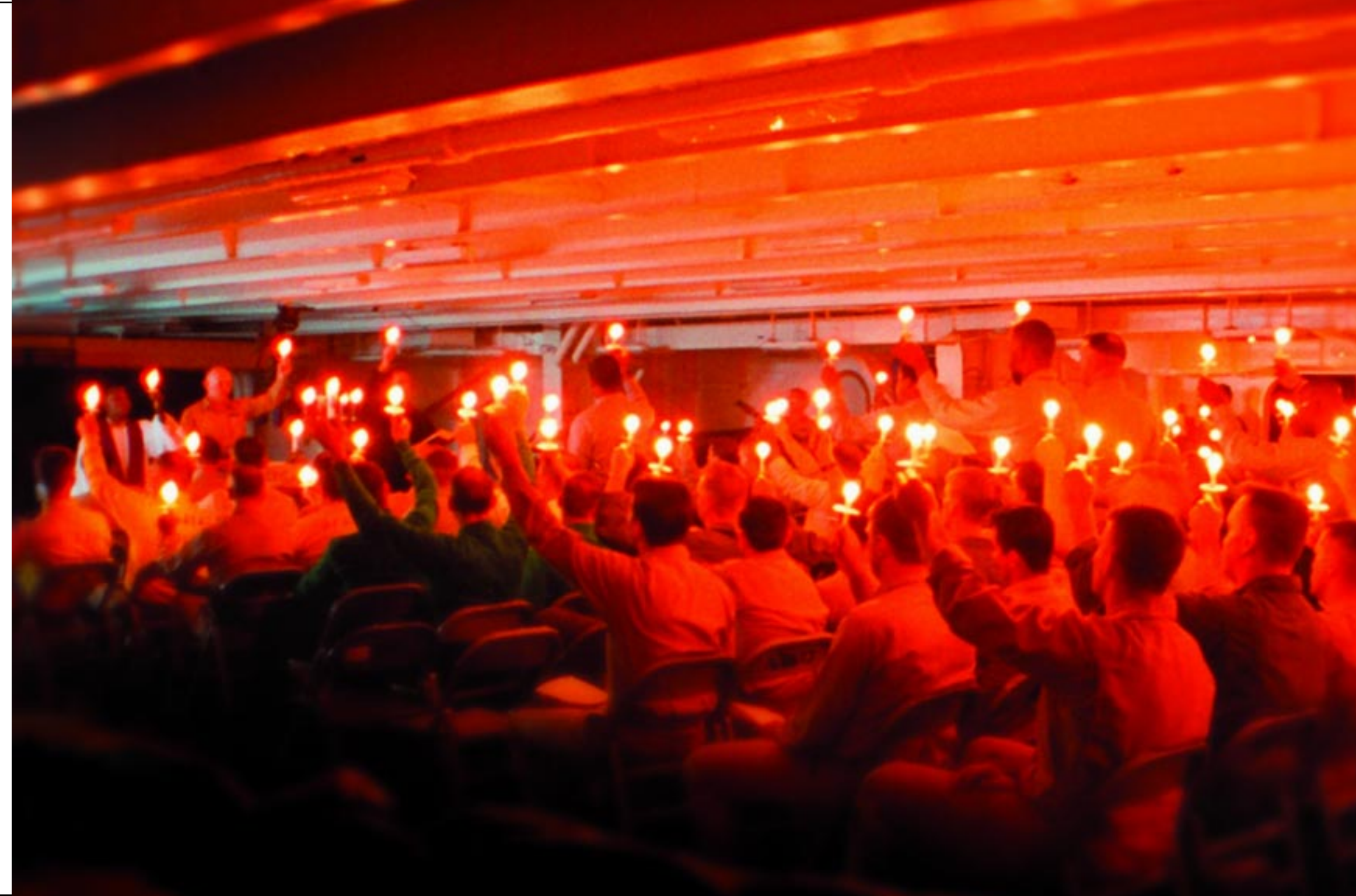
The source of their light.