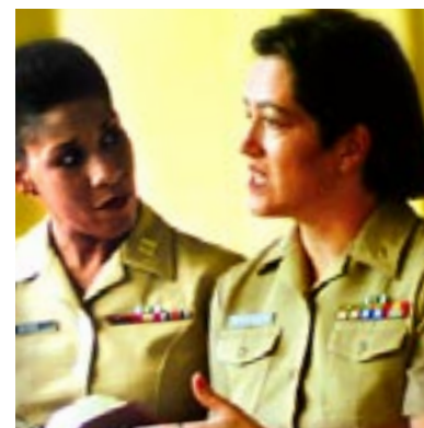
The touch point of their faith.

As a Navy Chaplain, you'll minister to your flock night and day. Eat, relax, work and worship together 24/7. Counsel them with your guidance. Walk with them day in and day out. From the mundane to the momentous, you will always be there.